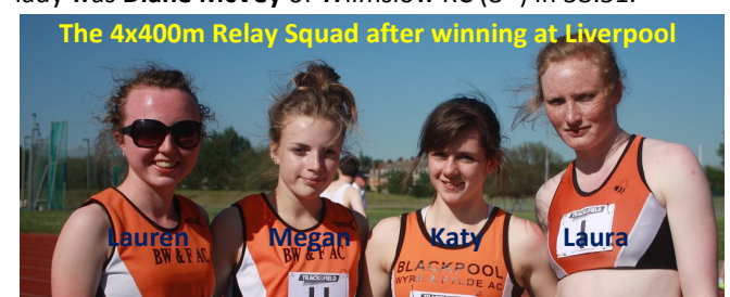
The 4x400m Relay Squad after winning at Liverpool